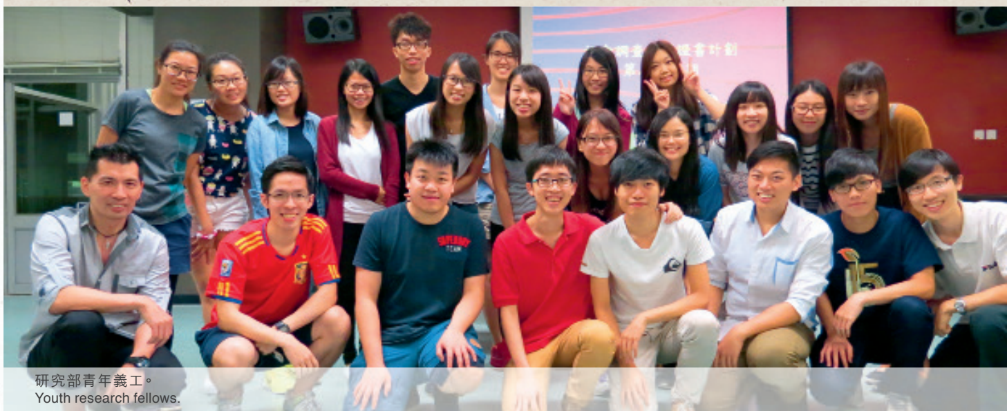
研究部青年義工。 Youth research fellows.