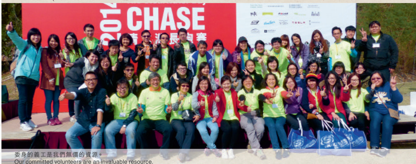
委身的義工是我們無價的資源。 Our committed volunteers are an invaluable resource.

面對通脹和雨傘運動、加上事工受到數碼潮流及波動的零售市場所影響，本年度的財政仍然是困難的一年。在各項不明朗因素和困難中，本年度的赤字為235萬元。當中我們仍看見上帝恩典的供應、透過忠心支持者的捐獻以及事工伙伴的同行，加上同工們的努力。