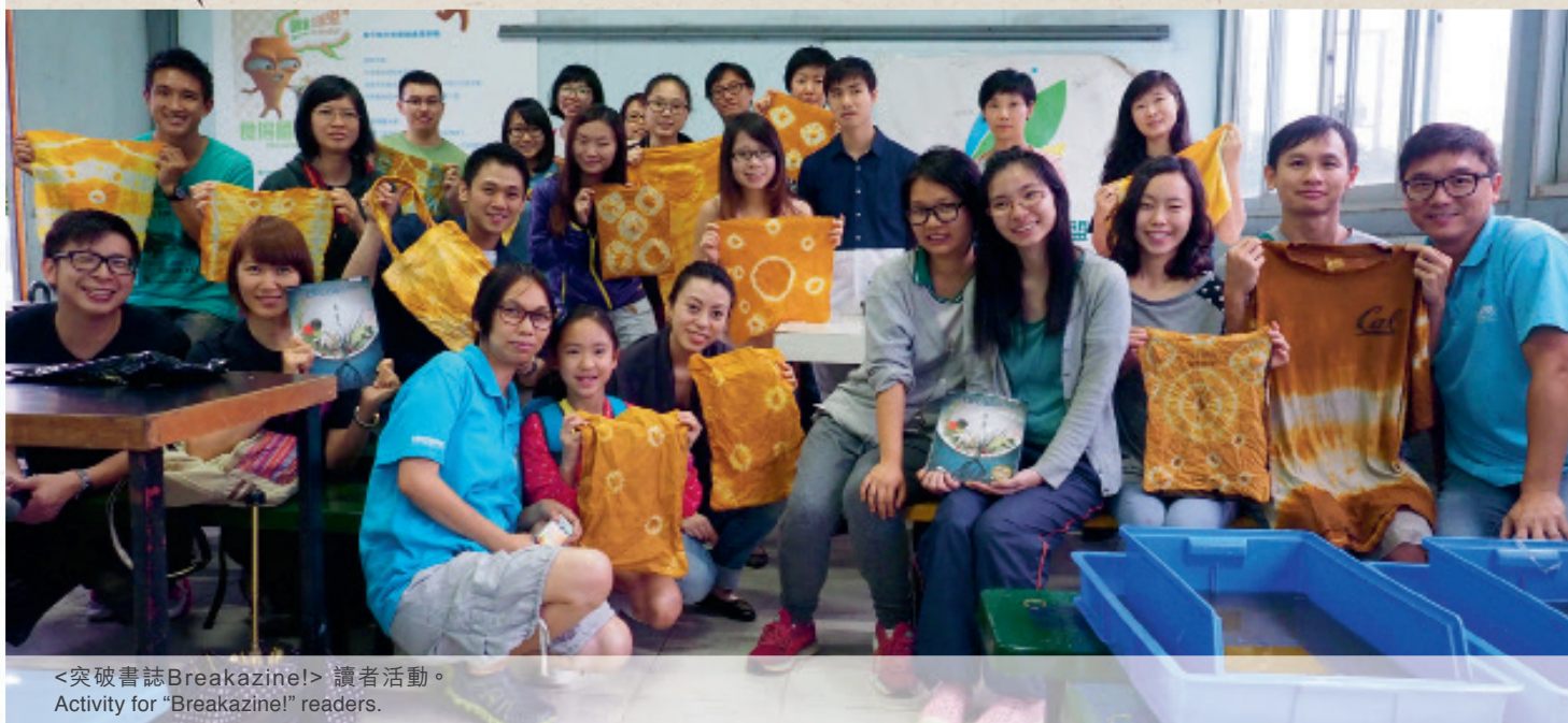
<突破書誌Breakazine!> 讀者活動。 Activity for "Breakazine!" readers.