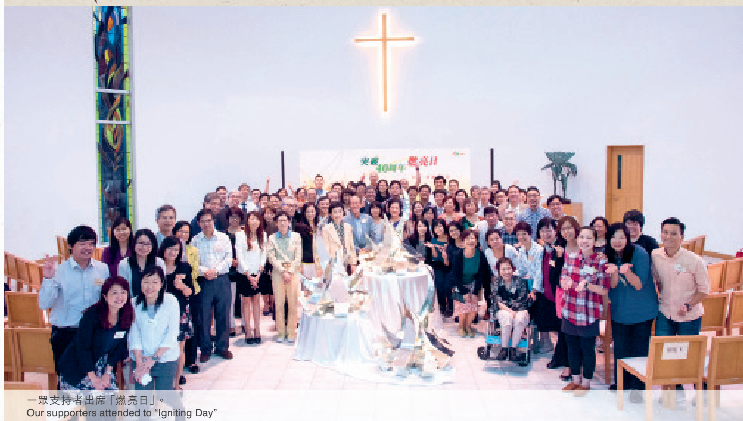
—眾支持者出席「燃亮日」。 Our supporters attended to "Igniting Day"

「突破」多年來重視啟發青年探索生命，而在推展事工的同時，我們極需要一羣擁抱著同一使命的伙伴在禱告、金錢、甚或人力資源上支持我們。感恩這些支援多年來都從不間斷。