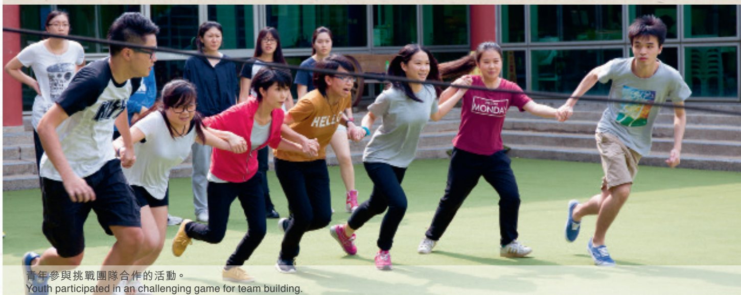
青年參與挑戰團隊合作的活動。 Youth participated in an challenging game for team building.