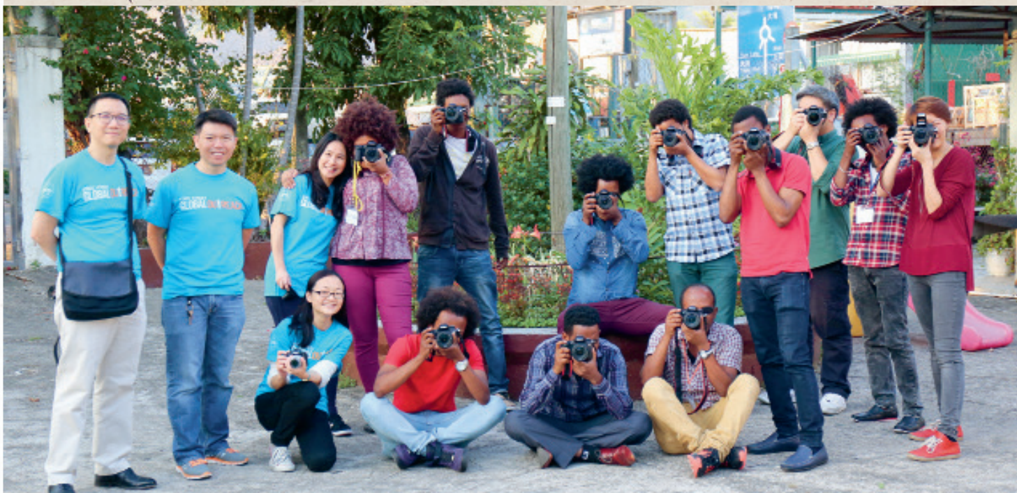
於錦田開辦跨種族人士的攝影班。 A cross-ethnic photography course held at Kam Tin.