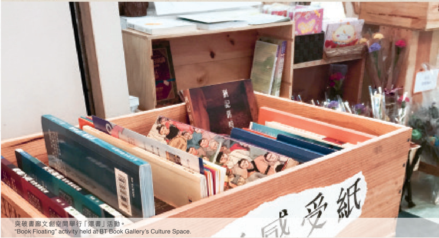
突破書廊文創空間舉行「漂書」活動。 “Book Floating” activity held at BT Book Gallery's Culture Space.