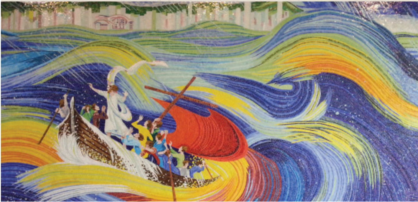
由支持者奉獻的一副壁畫「平靜風浪」。 A mural "calm the storm" was dedicated by the supporter.

物業設施管理透過創造空間及建立羣體，為青年羣體提供成長訓練、生命反思、價值重整的環境和設施。年內，突破青年村及突破中心共服務超過15萬人次的青少年及青少年工作者，並有百多位青年義工與我們並肩同行。