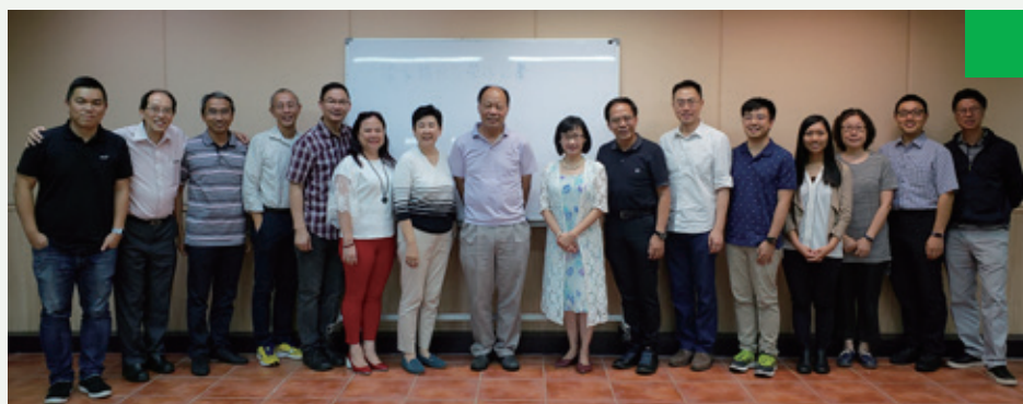
突破機構董事會成員和同工合照。 Board members and staff of Breakthrough Limited.

Similarly, Breakthrough may not have the capability to help every youngster to achieve his/her life goal, nevertheless, we strive our best to prepare them the awareness and passion to recognize their dreams through our most sincere and supportive company in their life journey.