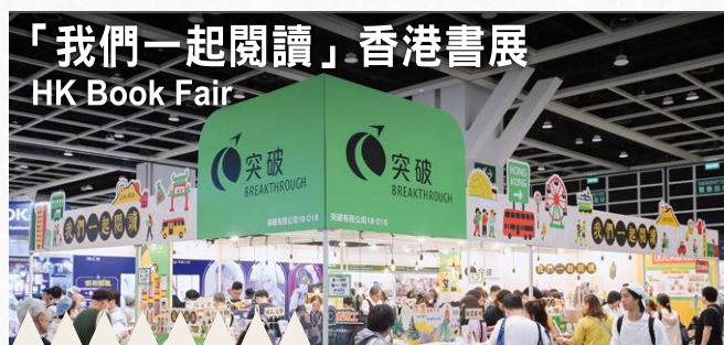
「我們一起閱讀」香港書展 HK Book Fair