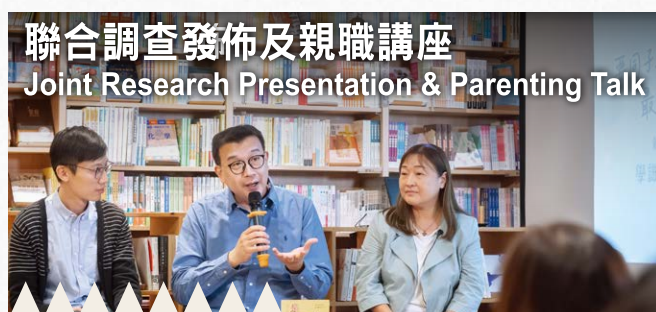
聯合調查發佈及親職講座 Joint Research Presentation & Parenting Talk

This year, six young artisans participated in the program through classes and workshops that combined theory and hands-on practice. They also showcased and consigned their creations at the Breakthrough Book Gallery.