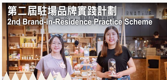
第二屆駐場品牌實踐計劃 2nd Brand-in-Residence Practice Scheme

Through art and everyday practice, young creators in the project reignited their creative energy and reflected on their roles within the community.