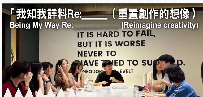
「我知我詳料Re:_____ (重置創作的想像) Being My Way Re:_____ (Reimagine creativity)

The theme "Together We Read" was adopted for the 2024 HK Book Fair, implying the message of "Together in Reading, Together for Each Other".